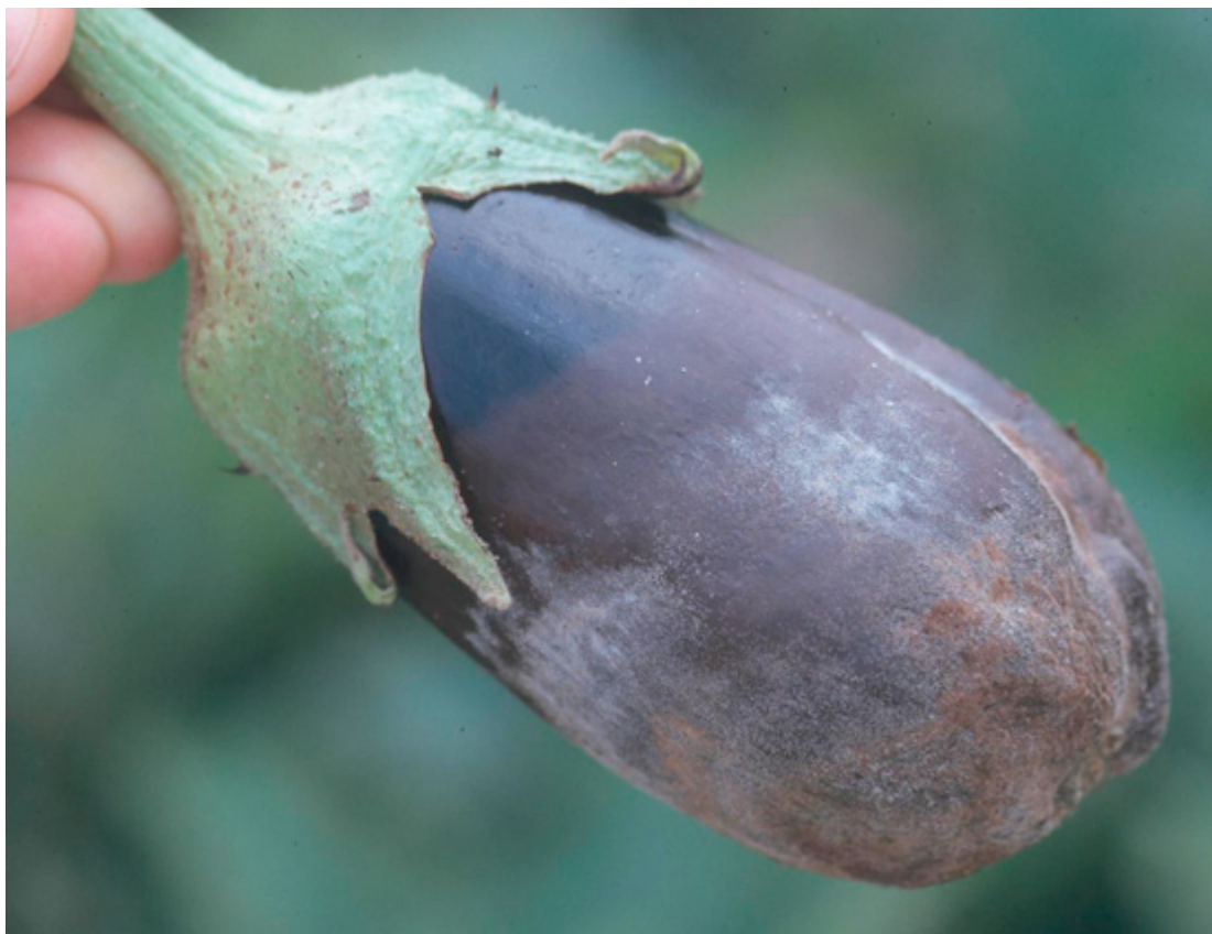
Powdery mildew on eggplant

Powdery mildew on pepper and eggplant – Vivando 30 ml/ha; Dagonis 60 ml/ha; Zoxis 250 EC 70 ml/ha; Ortiva Top SC 100 ml/ha; Prev-Gold 160–600 ml/ha; Reflect 125 EC 100 ml/ha; Systhane 20 EW 30–37.5 ml/ha; Systhane Ecozom EW 65–165 ml/ha; Sonata SC 500–1000 ml/ha; Taegro 18.5–37.0 g/ha; Tazer 250 SC 80–100 ml/ha; Thiovit Jet 80 WG 300 g/ha; Topaz 100 EC 35–50 ml/ha; Phytosev 200 ml/ha; Hercules 125 SC 50–75 ml/ha; Cidely Top 100 ml/ha.