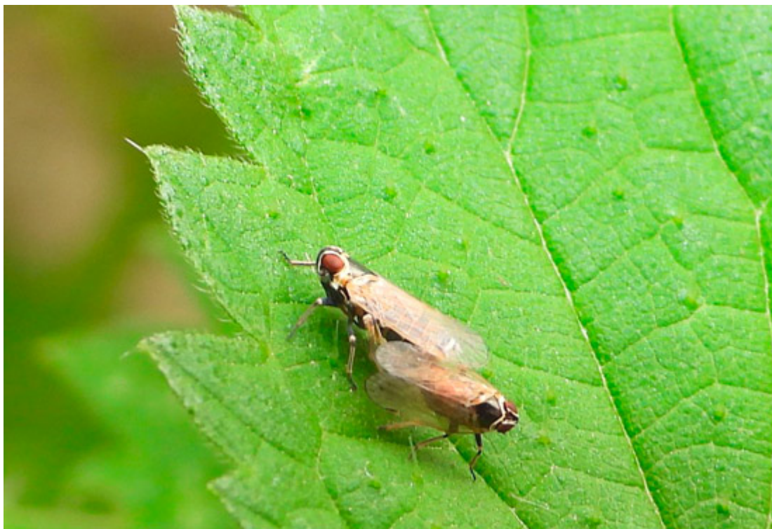
The leafhopper Hyalestes obsoletus

The flight of the leafhopper Hyalestes obsoletus continues, and with it the risk of new infections and expansion of the scale of diseased plants with stolbur in pepper, eggplant, tomatoes, celery and others. To control the vector, treatments are carried out with: Vaztak Nov 100 EC 10 ml/ha; Mageos 7 g/ha; Mospilan 20 SP 25 g/ha.