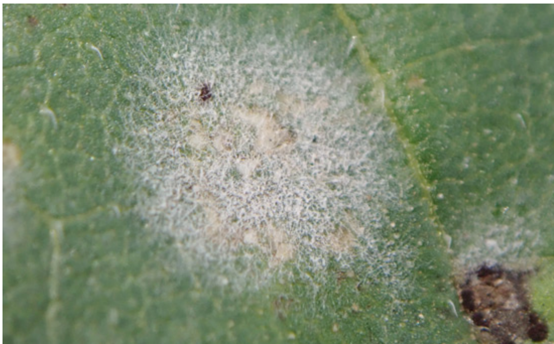
Powdery mildew on cucumbers

Powdery mildew on cucumbers – Vivando 20 ml/ha (0.02%); Dagonis 60 ml/ha; Domark 10 EC 50 ml/ha; Zoxis 250 EC 70 ml/ha; Collis SC 40–50 ml/ha; Legado 80 ml/ha; Limocide 800 ml/ha; Ortiva Top SC 100 ml/ha; Prev-Gold 160–600 ml/ha; Reflect 125 EC 100 ml/ha; Sivar 80 ml/ha; Sonata SC 500–1000 ml/ha; Topaz 100 EC 33.5–50 ml/ha; Trunfo 80 ml/ha; Phytosev 200 ml/ha; Fontelis SC 240 ml/ha; Cidely Top 100 ml/ha.